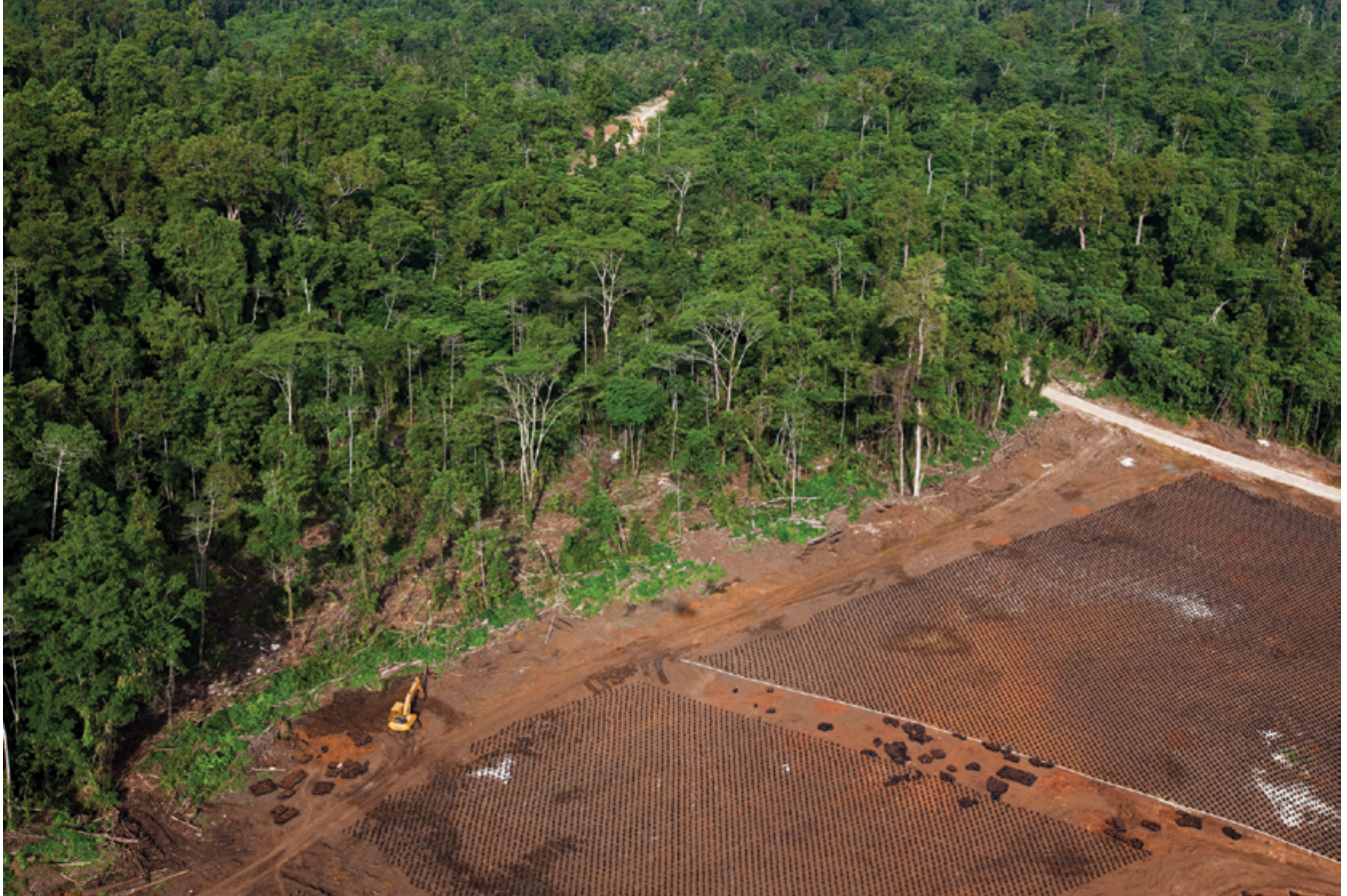
FOREST CLEARANCE FOR SABL (OIL PALM EXPANSION) IN BAIRAMAN VILLAGE