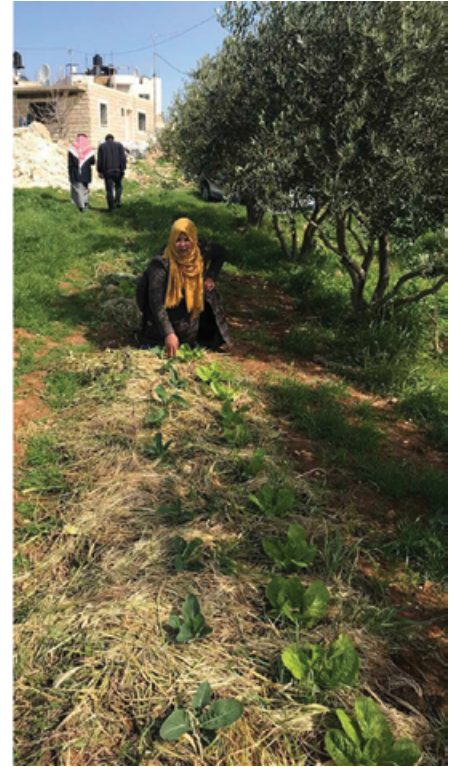
WOMAN WORKING FIELDS USING AGROECOLOGY METHODS CLOSE TO HER HOME