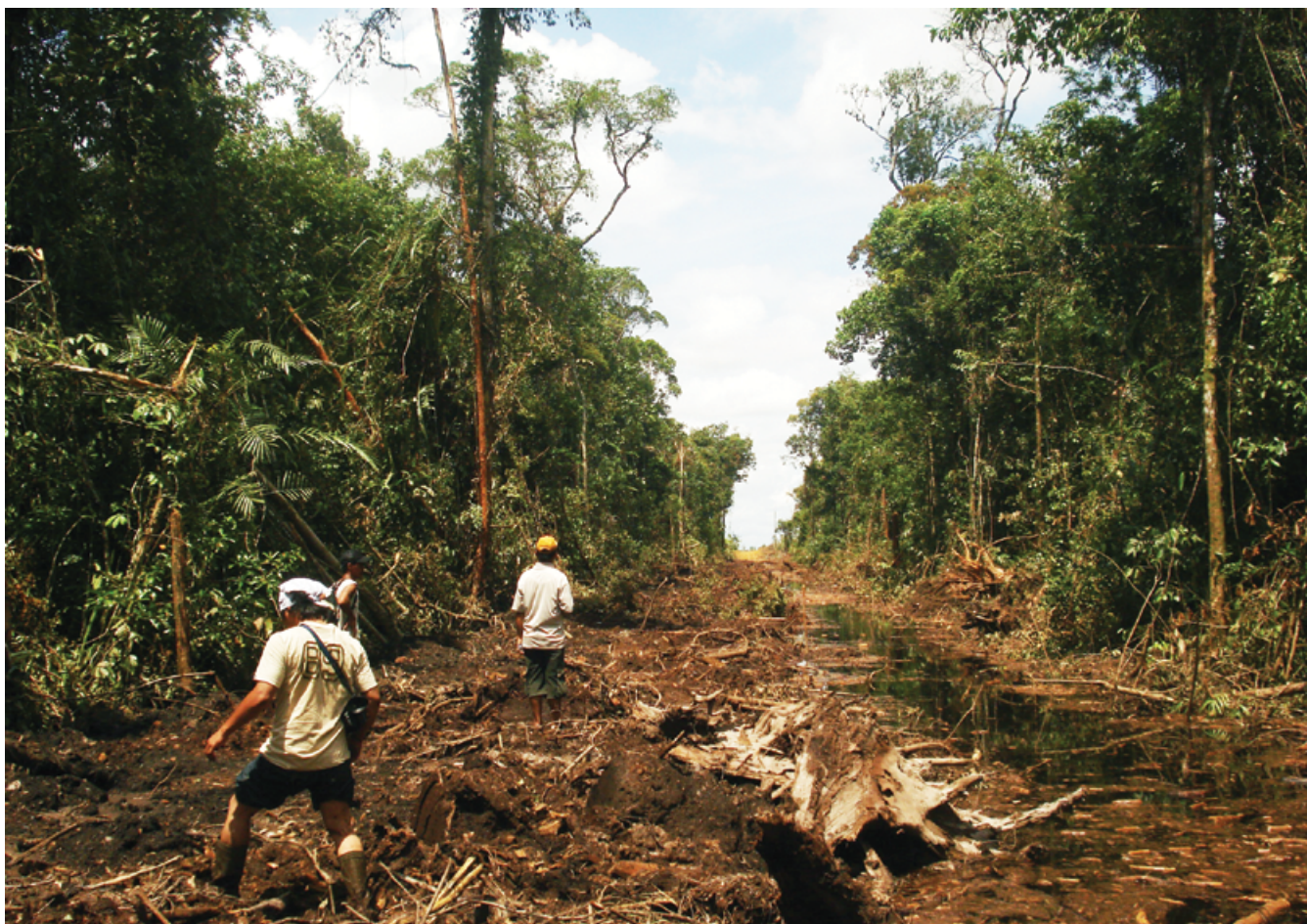
LAND GRABBING AND DEFORESTATION BY OIL PALM PLANTATION IN SEMUNYING VILLAGE, WEST KALIMANTAN