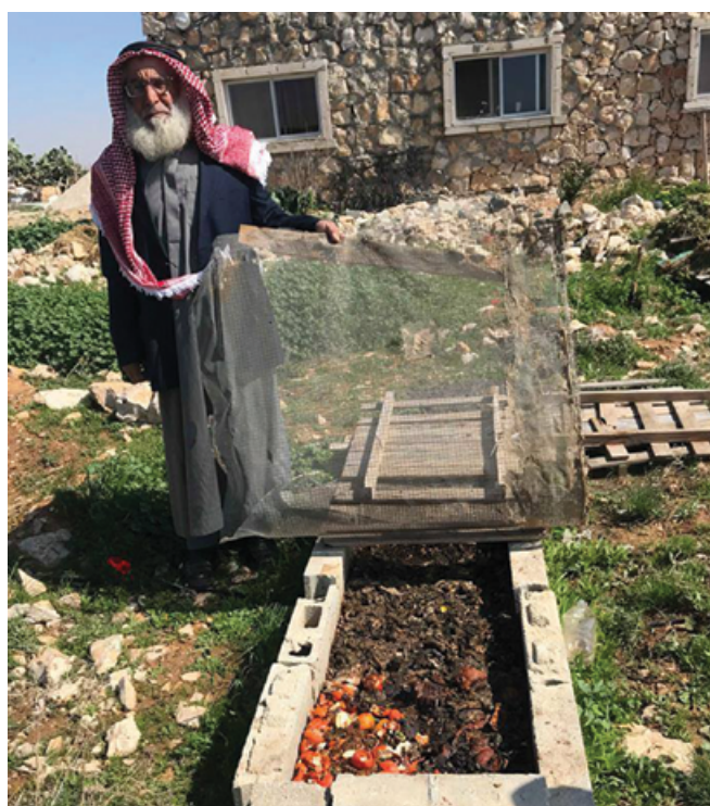
FARMER USING AGRO ECOLOGY METHODS IN PLANTING CLOSE TO HIS HOME

Finally the Land Law 1969 concluded the consolidation of the legal system for land and property governance. This law sets out all the rights, rules and regulations concerning the ownership and possession of immovable properties and land. It repeals previous land categories and any remaining Ottoman land laws and establishes the category of public and reserved lands as well as a land registry. It also proclaims that unworked land as state property, affecting the rights of the Bedouin community to their customary grazing grounds in the al-Naqab desert.