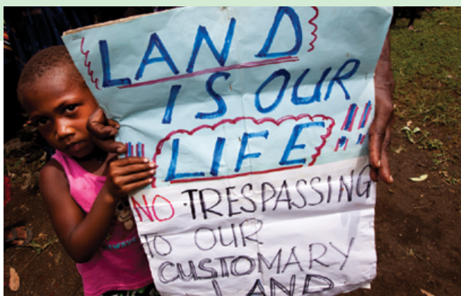
CHILD PROTESTING AGAINST OIL PALM PLANTATION OPERATIONS AND LOGGING IN BAIRAMAN VILLAGE