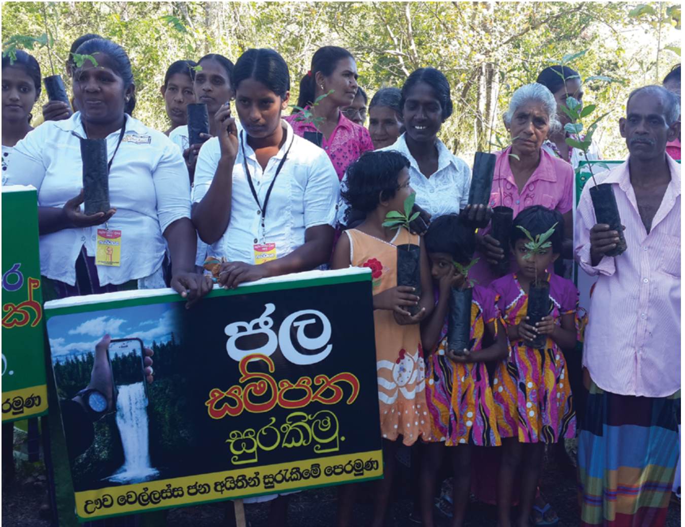
WOMEN FIGHTING AGAINST SUGARCANE PLANTATION IN BIBILA, SRI LANKA