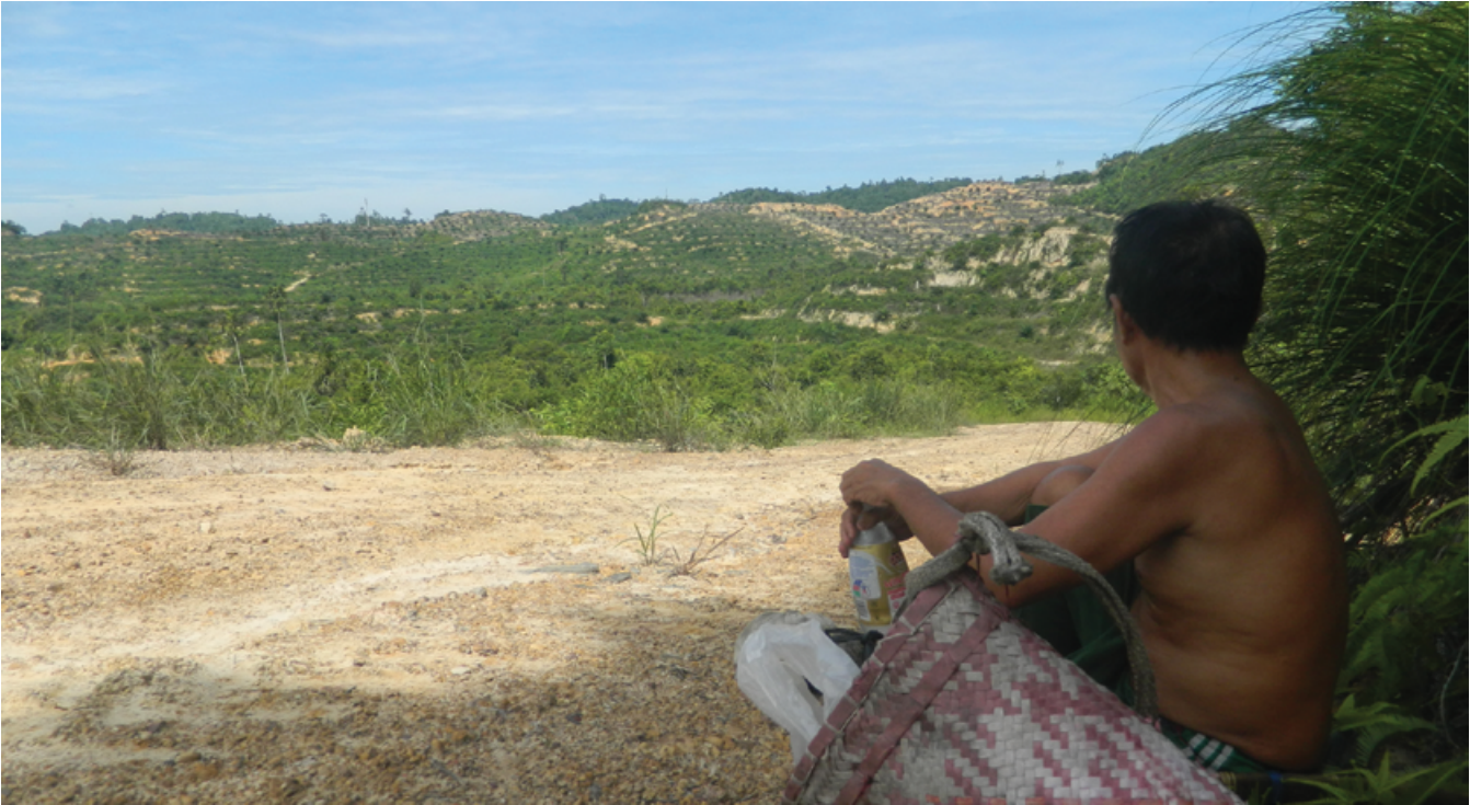
CUSTOMARY LAND OF INDIGENOUS COMMUNITIES FROM SUNGAI BURI, MIRI IN SARAWAK THAT HAS BEEN ISSUED WITH AN OIL PALM PLANTATION DEVELOPMENT LICENCE, WITHOUT THEIR KNOWLEDGE AND CONSENT