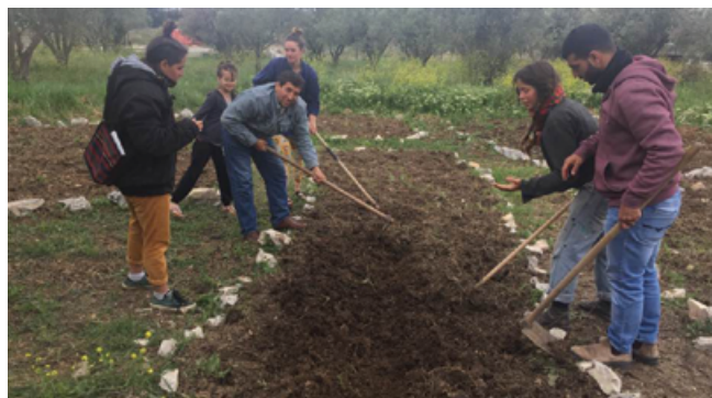
PALESTINIAN TRAINING IN AGROECOLOGY IN THE FIELD

In the 1990s, the Oslo Interim Accords divided the West Bank into three administrative areas. Area A which makes up around 18 per cent of the West Bank, is exclusively under the control of the Palestinian National Authority. Another 18 per cent is known as Area B, which is partially under the control of the Palestinian National Authority. The remaining land, Area C and a nature reserve, which takes up the remaining 61 per cent and 3 per cent of the land, respectively, is under Israeli military and administrative control, along with the entire border. In Area C, more than 200 Israeli settlements have been built with nearly 1,000 km of roads.