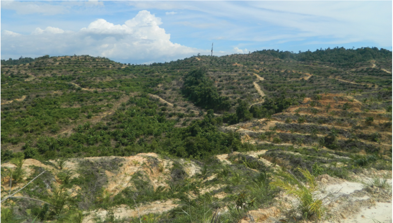
CUSTOMARY LAND OF INDIGENOUS COMMUNITIES FROM SUNGAI BURI, MIRI IN SARAWAK THAT HAS BEEN ISSUED WITH AN OIL PALM PLANTATION DEVELOPMENT LICENCE, WITHOUT THEIR KNOWLEDGE AND CONSENT