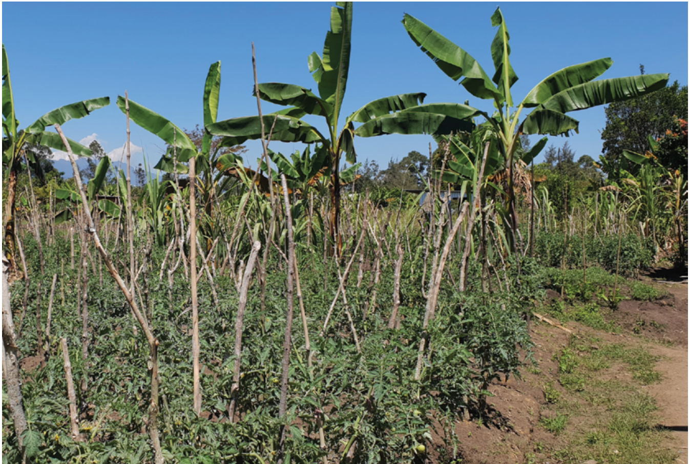
LOCAL MIXED CROP GARDEN (TOMATOES AND BANANAS), KILIP BLOCK, BANZ TOWN, JIWAKA PROVINCE, PNG