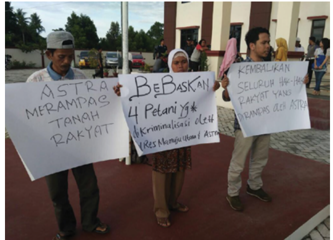
LAND GRABBING AND CRIMINALISATION OF PEASANTS BY OIL PALM PLANTATION ASTRA AGRO LESTARI IN CENTRAL SULAWESI

Apart from the forestry law, other laws on the exploitation of natural resources also operate on the basis that land that is without documentary support still belongs to the state. The state is therefore free to issue licences which destroy the living spaces of indigenous and traditional territories.