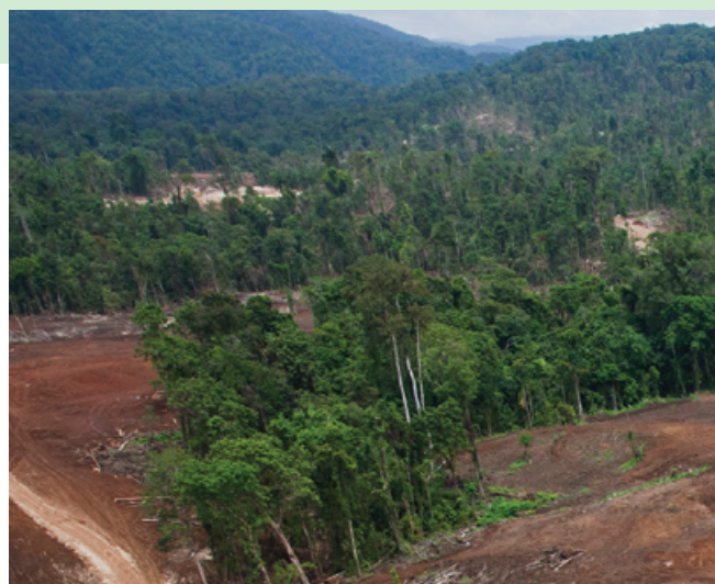
FOREST CLEARANCE FOR SABL (OIL PALM EXPANSION) IN BAIRAMAN VILLAGE