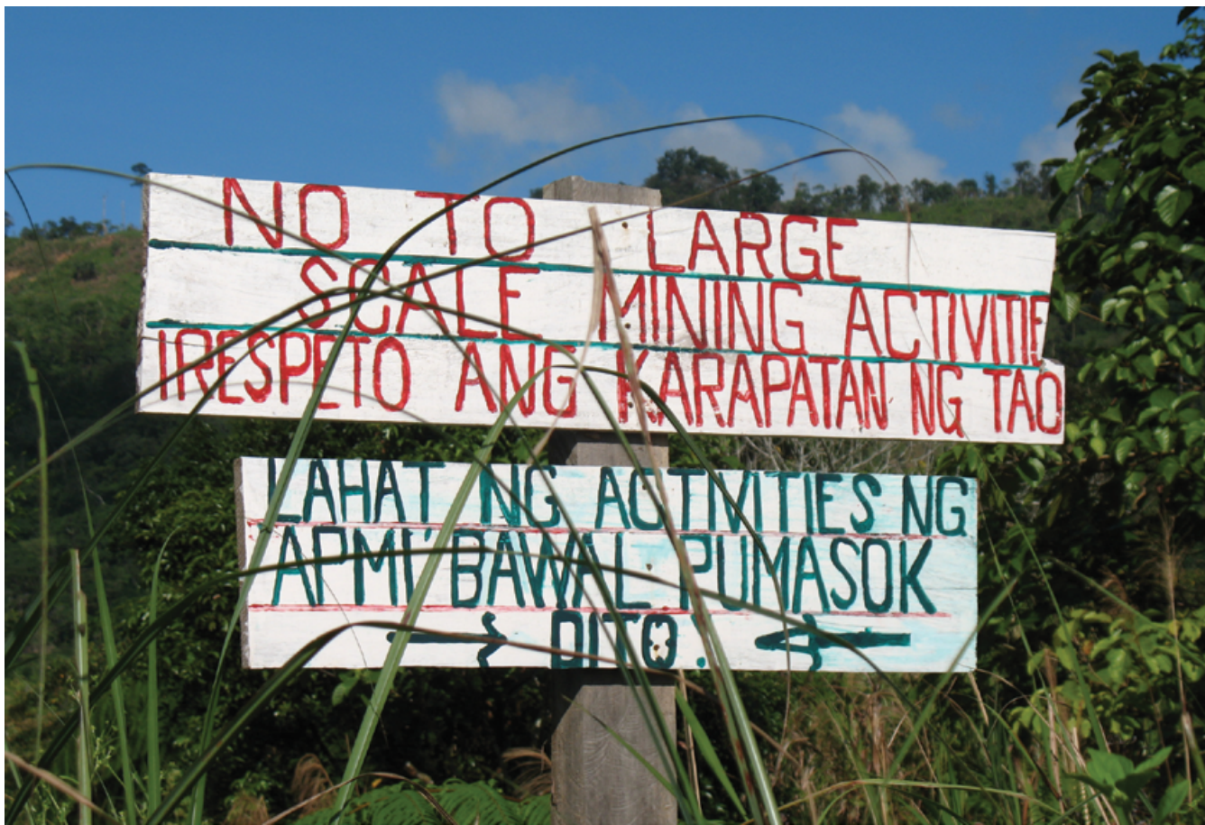
"NO TO LARGE SCALE MINING ACTIVITIES. RESPECT THE RIGHTS OF THE PEOPLE. ALL ACTIVITIES OF THE COMPANY CANNOT ENTER HERE" LOCALS EXPRESS THEIR RESISTANCE TO OCEANA GOLD MINING CORPORATION, DIDIPIO, KASIBU, PROVINCE OF NUEVA VIZCAYA